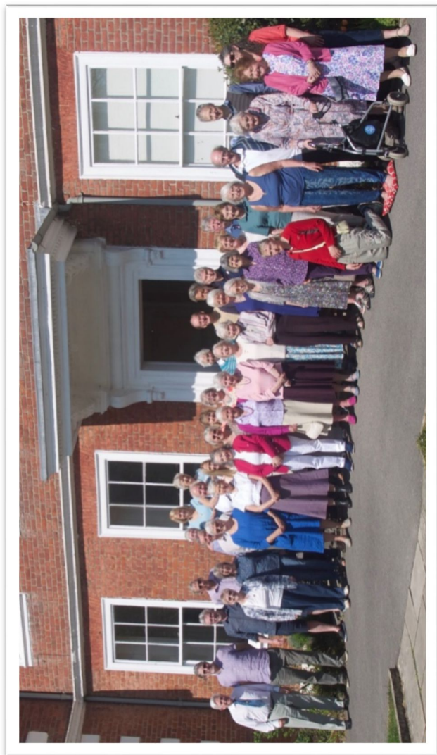
Friends gathered at Sarum College, Easter 2019

May HIS Love and Great Peace be with each and everyone today and always.