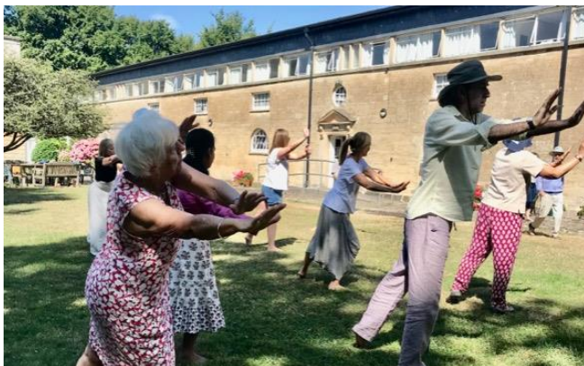
Dancing on the Lawn