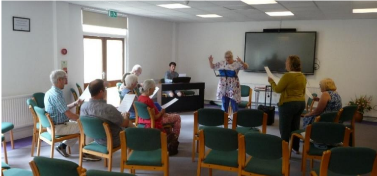
Singing in the John Todd Room