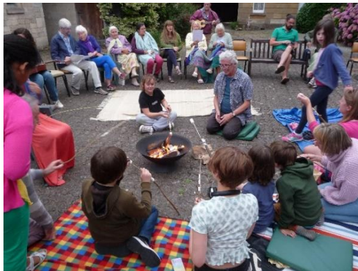
Toasting Marshmallows in the Courtyard