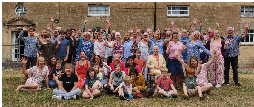
Annual Gathering Group Photograph